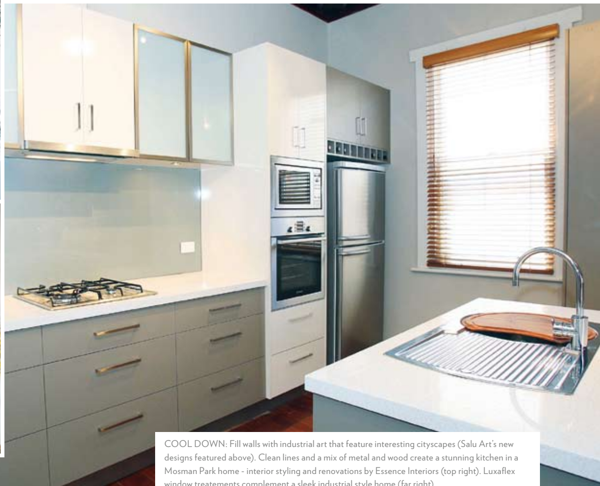
COOL DOWN: Fill walls with industrial art that feature interesting cityscapes (Salu Art's new designs featured above). Clean lines and a mix of metal and wood create a stunning kitchen in a Mosman Park home - interior styling and renovations by Essence Interiors (top right). Luxaflex window treatments complement a sleek industrial style home (far right).