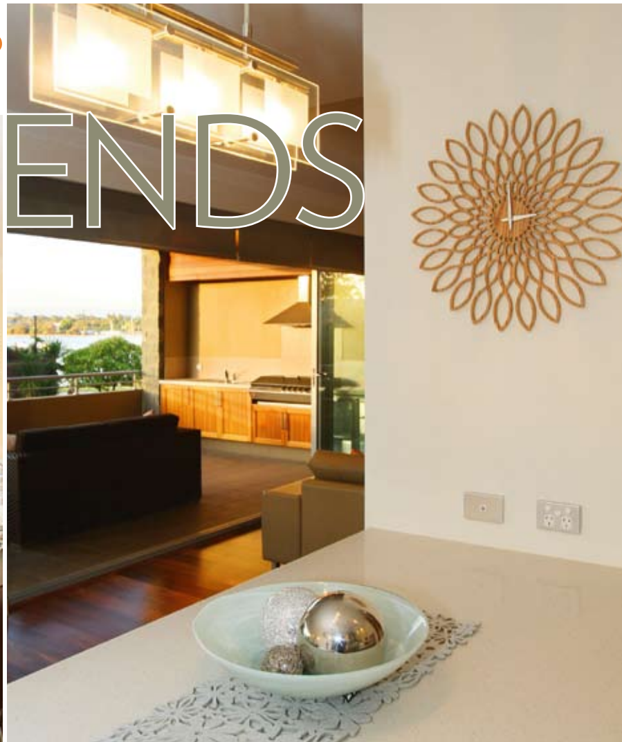
COLOURING IN : The interior of this Applecross abode by Essence Interiors (above) is a mix of raw materials and bold colour. Introduce stunning wallpaper with metallic detailing with the Tivoli range of wallpaper by the Wortly Group (below left).